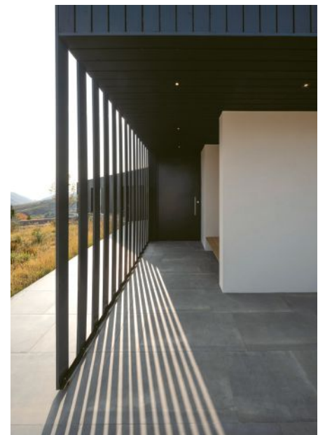
The entry sequence traces the topography of the sloped site, moving through screened views of the canyon panorama and stopping along the way at a built-in “mudroom” bench.

As careful as the house is to capture views for its occupants, it also does its best to preserve the views for others. “It’s not a canyon that’s heavily traveled, but quite a few hikers do go by,” says Anne Mooney, AIA. “We did try to