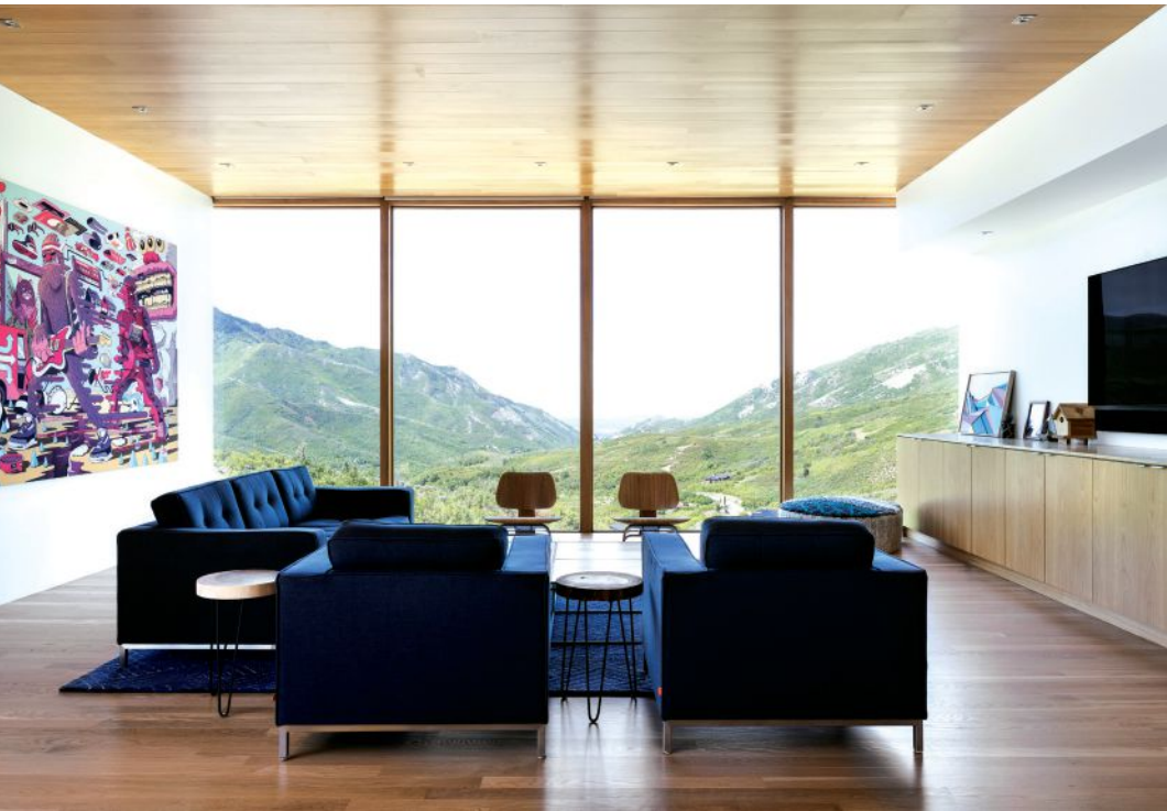
This page: The two volumes split at the entry hall, with one stepping down to the great room and the other continuing on to the family wing. Both kitchen and living area take in the sweep of the canyon's descent into Salt Lake City, while the bedroom wing terminates in a mountain view.