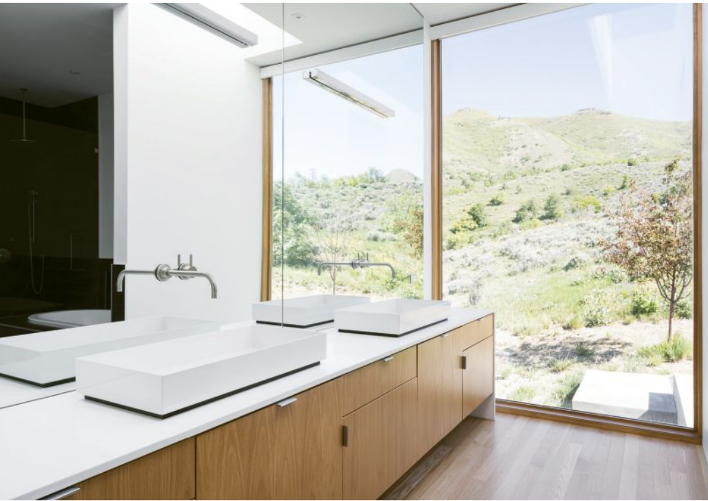
This page: Sleek interior finishes keep the eyes moving to framed views of canyon, mountains, and city. The clients, who collect art, requested space to display their favorite pieces.