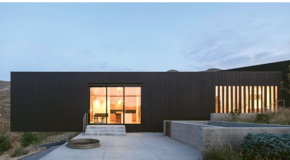
This page: The house's cantilevered volumes nestle below the ridgeline, preserving views from the road. Outdoor living is clustered in patios that also serve as fire breaks. A blackened steel firepit warms cool nights, and a board-formed concrete dog run protects the family pet from predators.

reduce the mass of the house and embed it in the site. Those cantilever volumes float off the ground, but we were careful to ensure that sightlines were preserved and that we did not build on a ridgeline. It's such a spectacular place.”