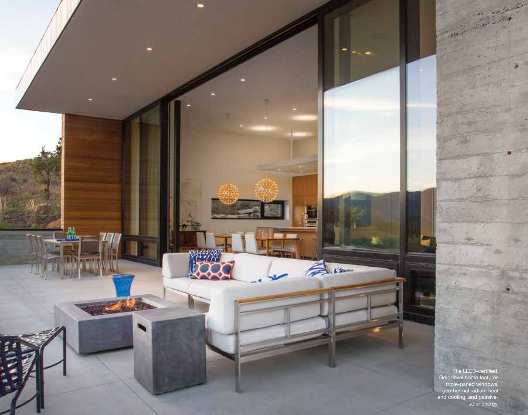
The LEED-certified, Gold-level home features triple-paned windows, geothermal radiant heat and cooling, and passive-solar energy.

result, the cooking and cleaning occurs behind the scenes, and the exposed modern kitchen remains clean and uncluttered. Similarly, the living room's wet bar remains hidden behind a rolling wall that opens for parties and closes for daily life. A gym, storage space, and a ski and bike prep room (daughter Julia races for the Park City Ski Team) occupy the lower level