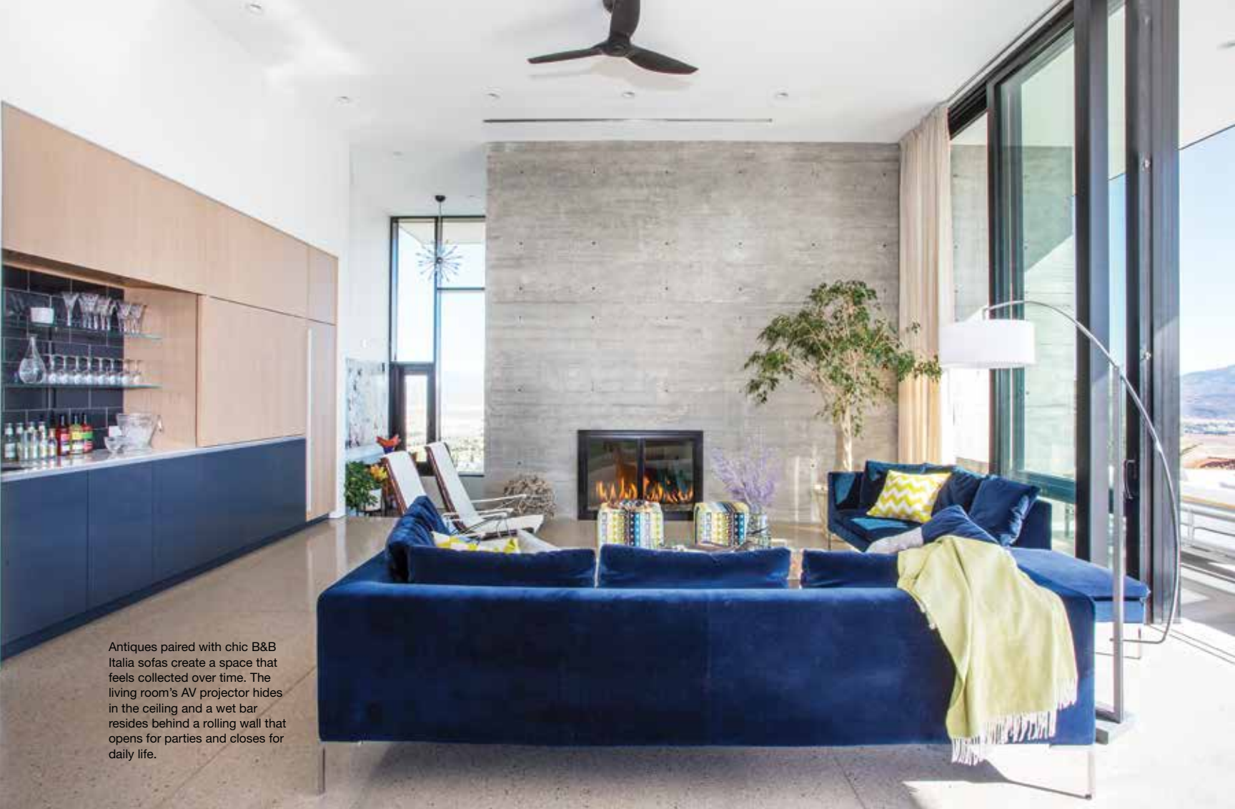
Antiques paired with chic B&B Italia sofas create a space that feels collected over time. The living room's AV projector hides in the ceiling and a wet bar resides behind a rolling wall that opens for parties and closes for daily life.

Modern is not a term normally associated with the architecture of Park City's Glenwilde community, but Ken and Julie Chahines' progressive new home in the gated golf course enclave may change that. Overlooking picturesque views of the mountains and town below, their dynamic dwelling marries bold, clean-lined design with the dynamic style and easy livability that modernism provides.